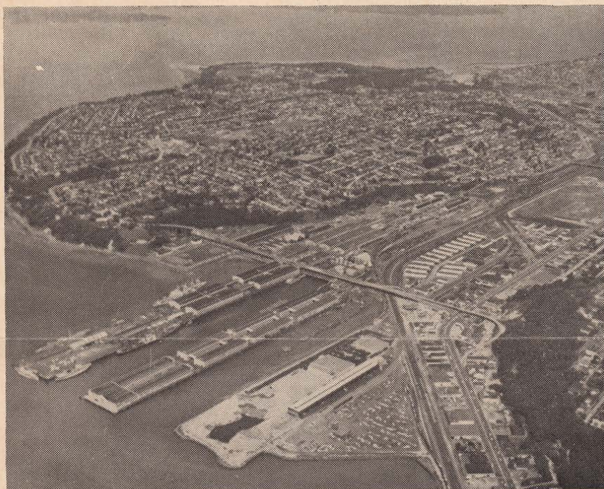
Pier 91 — Seattle — Can be visited while you are in Seattle for the 1968 Convention of PHSA.