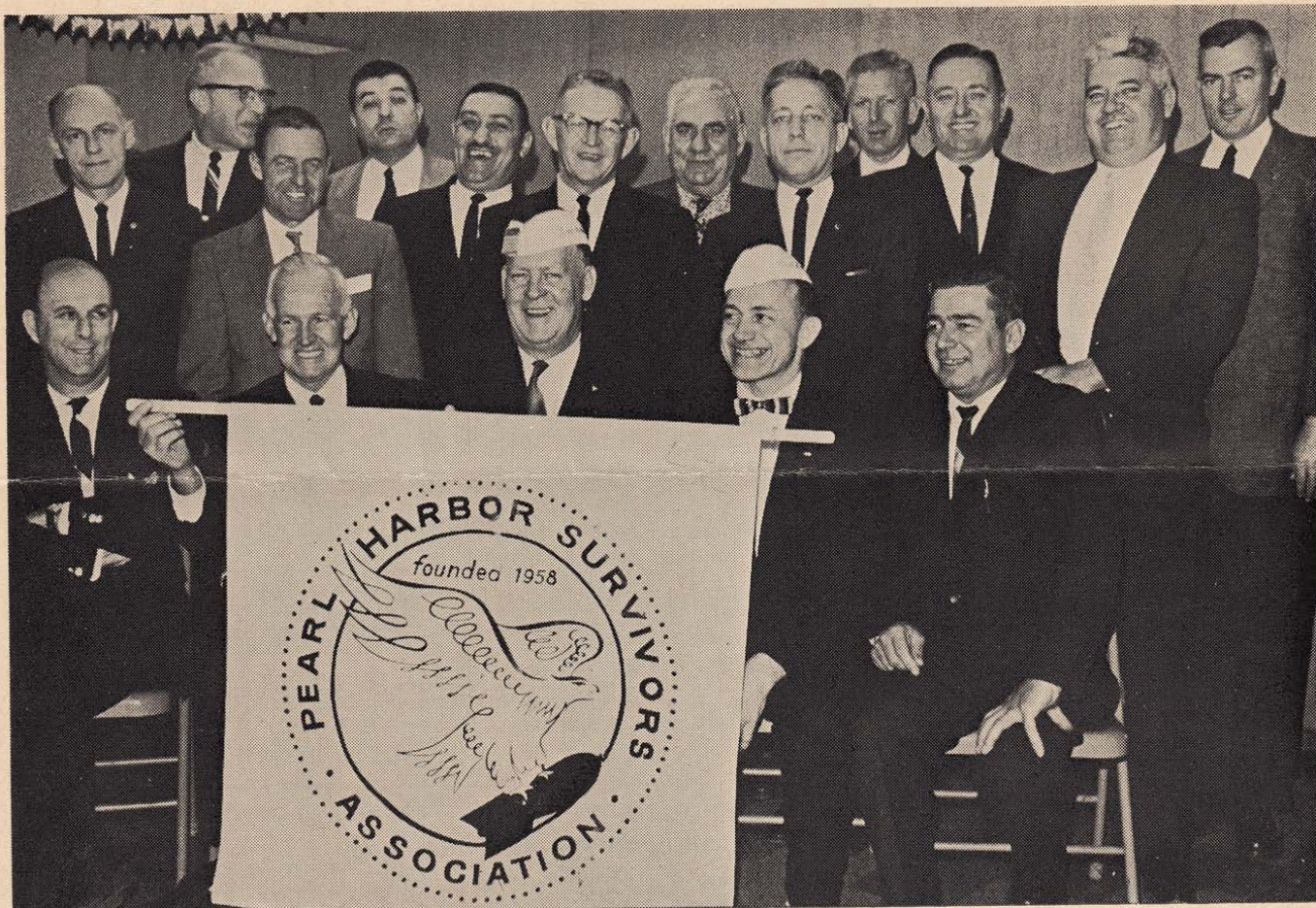
Some of our Connecticut Members