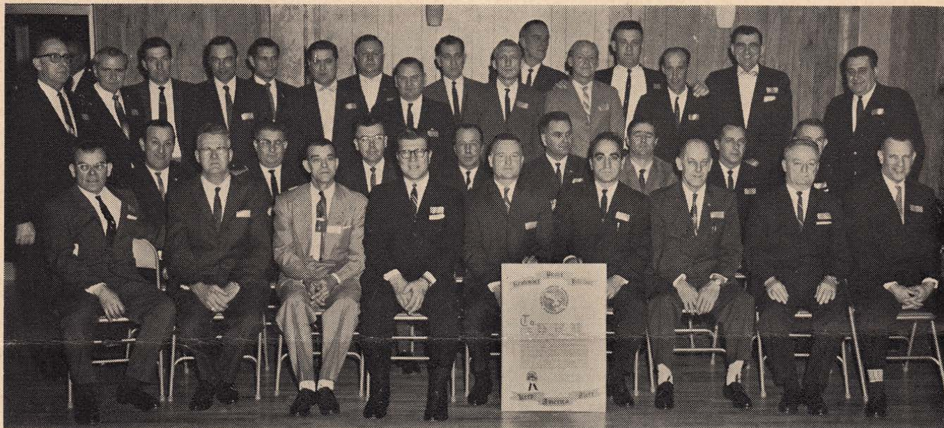
The New Jersey Chapter of the Pearl Harbor Survivors Association held their Charter presentation dinner and dance at the John Cavanaugh VFW Post No. 2290, Manville, New