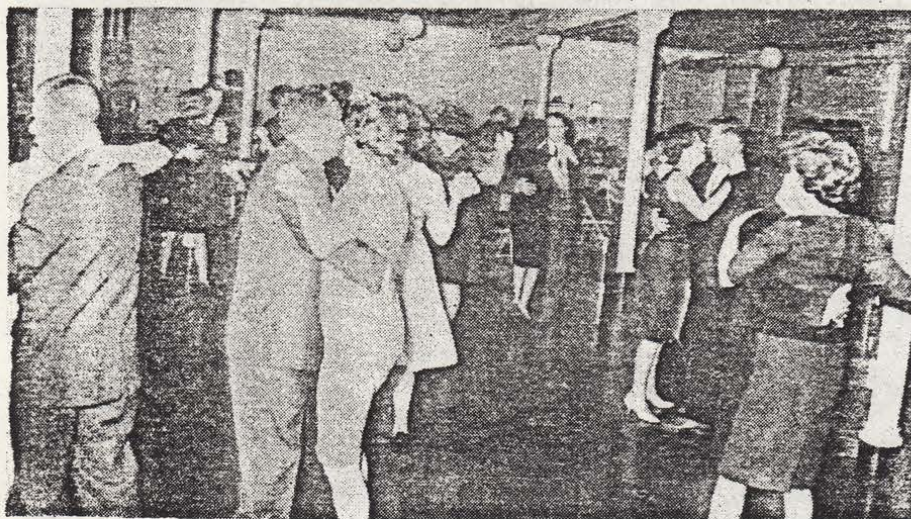
Part of the huge crowd attending the 2nd annual dinner dance